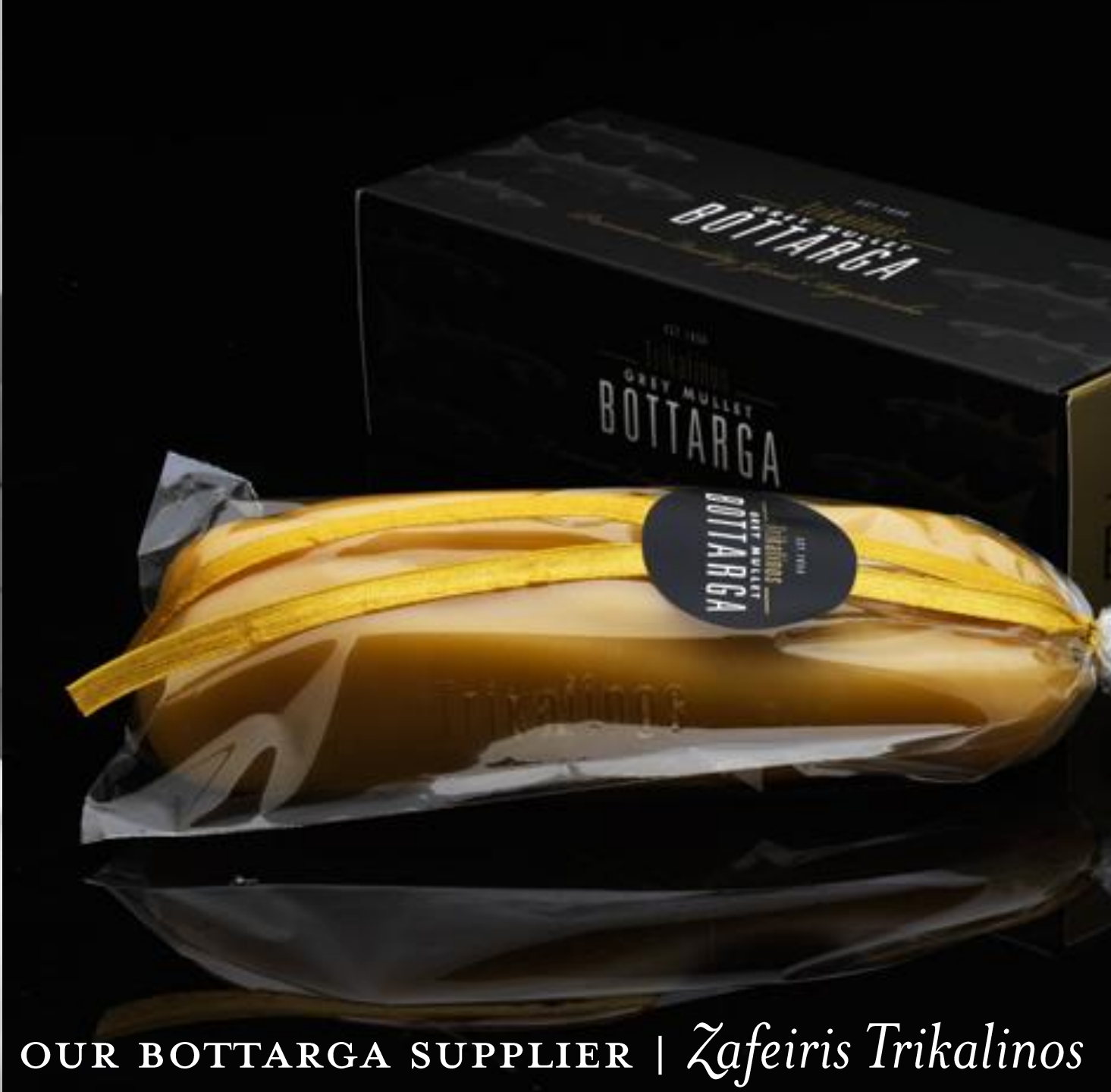
OUR BOTTARGA SUPPLIER | Zafeiris Trikalinos