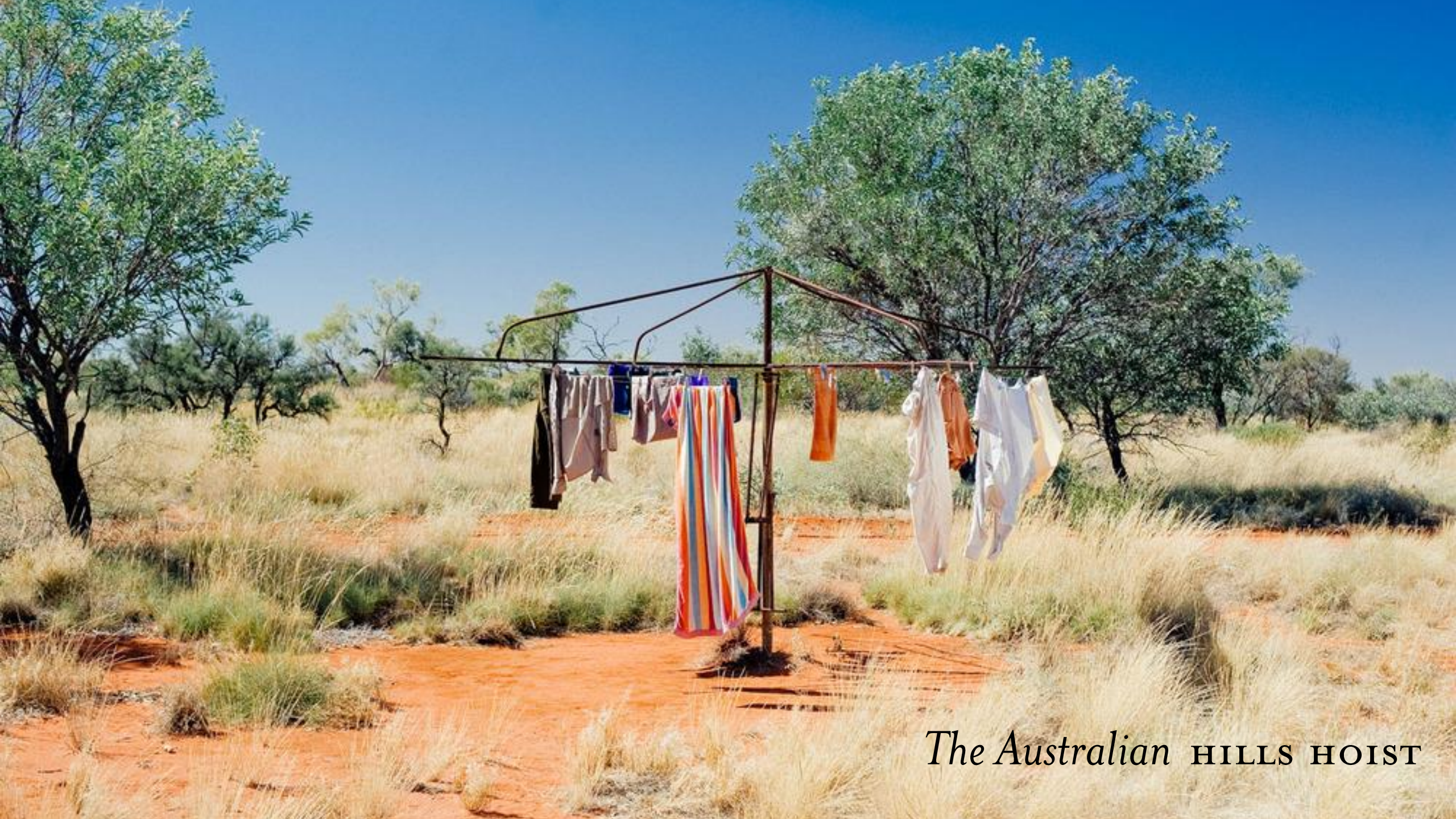
The Australian HILLS HOIST